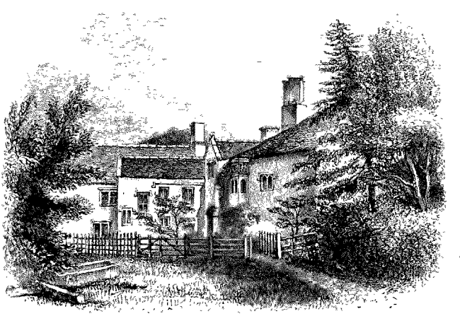
Entrance to Tartle Solibury Mance from the East

Escaping, however, out of Parker's hands, the Tutor departed homeward, and once more entered the hospitable abode of Little Sodbury, but more than ever firmly resolved.