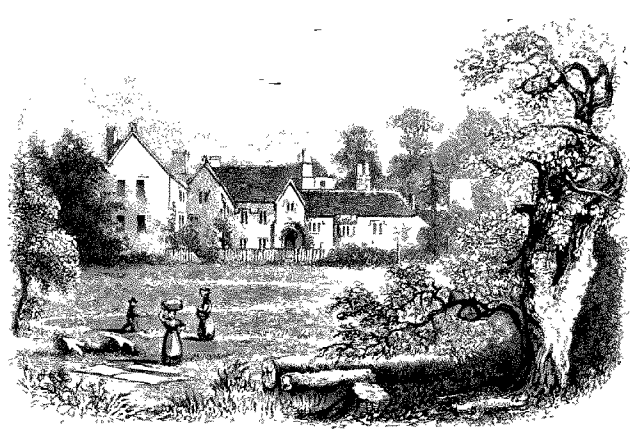
Less distant Nerr.

side of the hills. In the sketch already given, one of these clumps may be seen on the left, but a nearer view will give a better idea of the house itself.