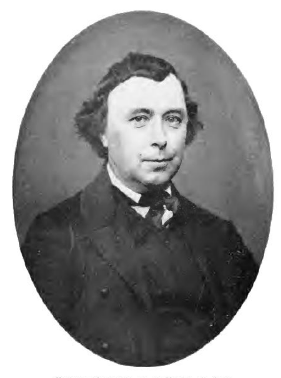
FATHER CHINIQUY AT 50 YEARS OF AGE