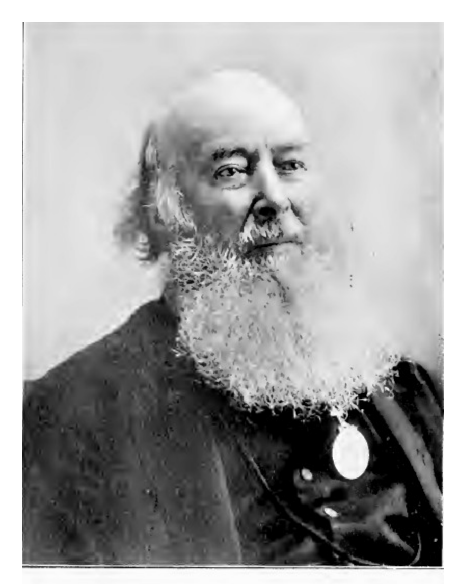
Truly yours be behoringing.