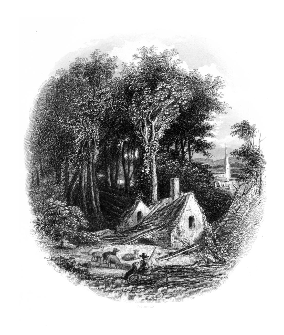
"Far opening down some woodland seep. In their own quiet glade should sleep."