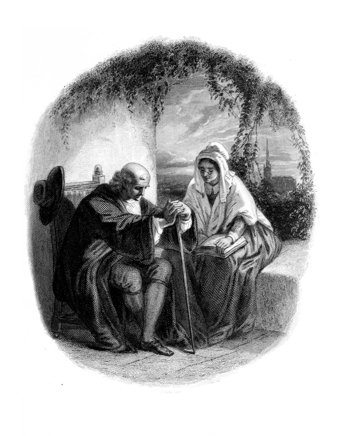
You it is howard to compare the day is far as