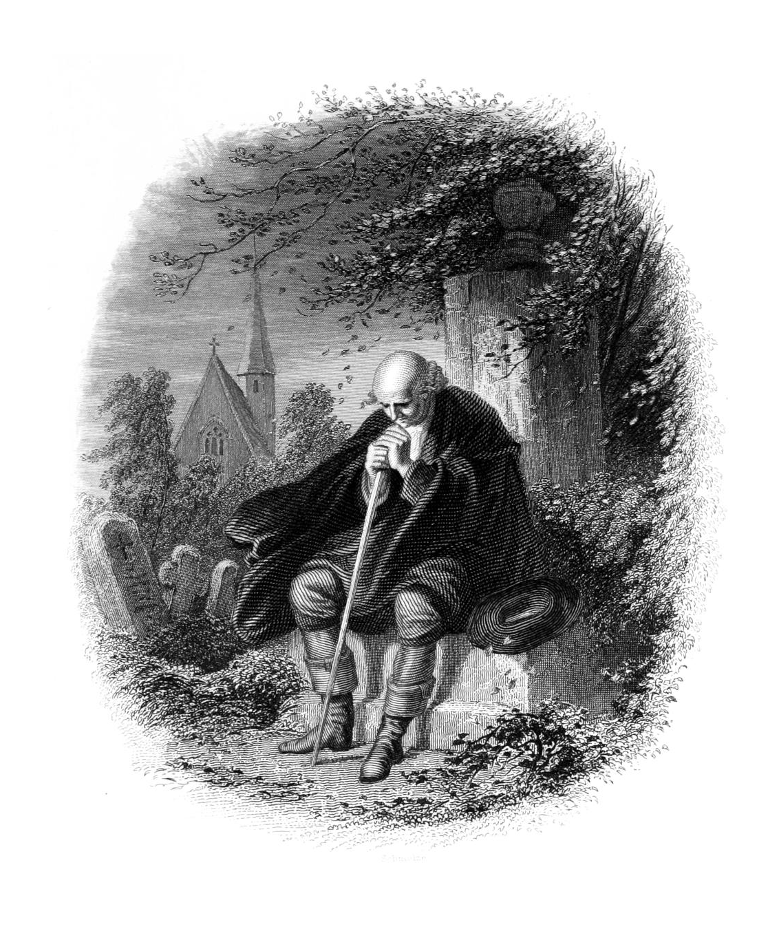
♦ Man's Portion is to Die