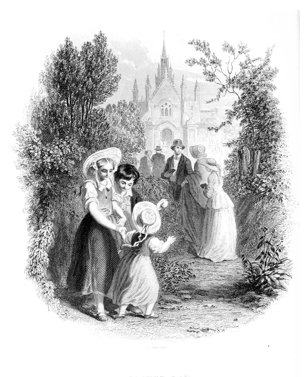
EASTER DAY. The Day of days Shall hearts set free