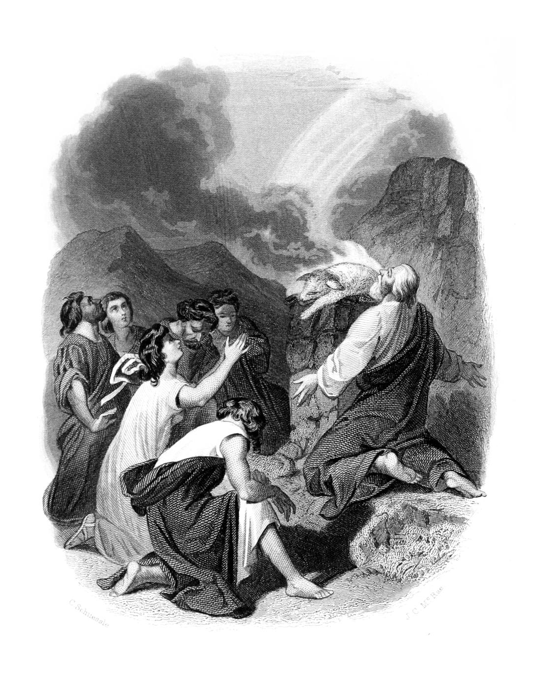
♦ The Bow In The Cloud