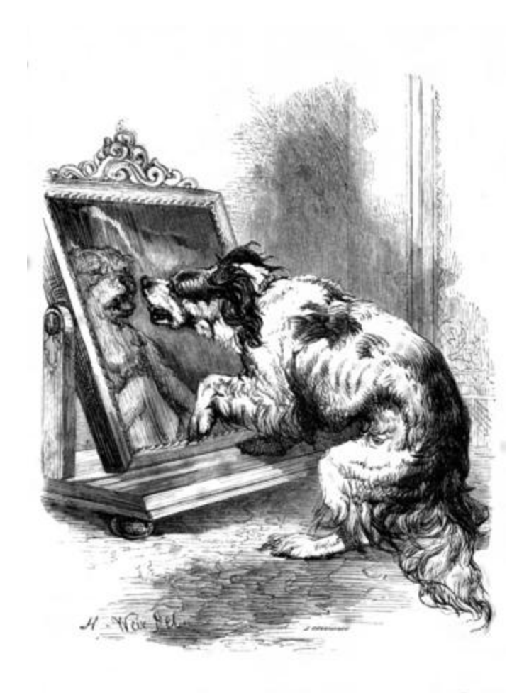
CAPTAIN AND THE LOOKING GLASS