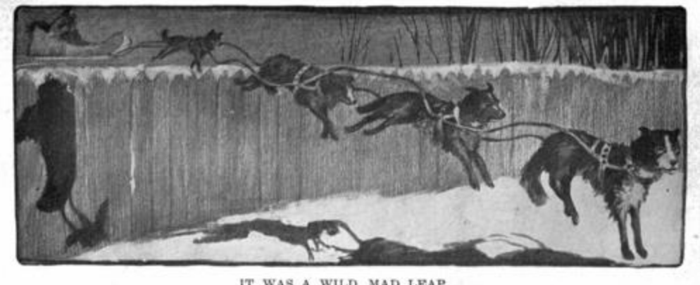
IT WAS A WILD, MAD LEAP.

But ere the journey ended, they played me a shabby trick, and in a measure got their revenge on me. At the bottom of the hill, on which the house of this native agent was built, he had dug a trench and there fixed a heavy stockade to break the force of the wild storms that, sweeping over the lake, drifted the snow around his home. This stockade was fifteen or eighteen feet high. The storms had so piled up the snow on the lake side that it was now level with the top; while over the other side there was a drift of only about five or six feet in depth.