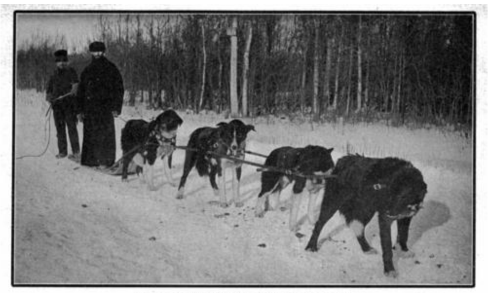
STILL ON THE TRAIL WITH THE DOGS.

loose cap with large fur ears. A long fur coat was very comfortable, but as such garments are very expensive, we found out that very comfortable and serviceable attire could be made for us by the native women, out of the warm Hudson's Bay blankets of the country. To these coats as well as to similar garments, were attached large warm hoods. These hoods, which are called capotes in that country, are very comfortable not only by day when traveling but when pulled up over the fur cap at night.