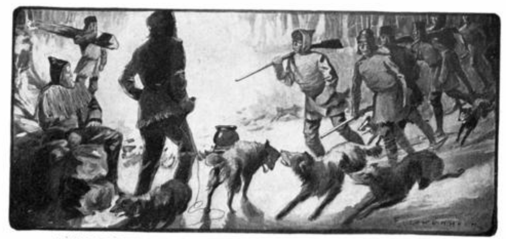
A HALF DOZEN WILD LOOKING INDIANS RUSHED INTO OUR MIDST.

While two of the men with whips and clubs kept the invading Eskimo beasts out of the camp, with my other Indian I chatted with these visiting strangers. They told me that they had come from the Cumberland district to fish through the ice on Lake Winnipeg, and hunt what game they could find in the forests on the shore. They said that they had had very little success and were very hungry.