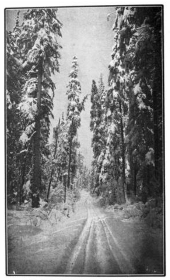
THE LORDLY PINES IN WINTER DRESS.

There are absolutely no roads, or paths, or trails, for hundreds, nor even thousands, of miles. The result is that there is absolutely no other way of winter traveling than with dogs, except going on foot, and even that becomes impossible when distances are greater than those where men can carry their own supplies. For their supplies mean much more than merely the food a man would consume. It means his bedding, weapons of defense, axe, snowshoes and various other things, in addition to kettles in which to cook his food. Hence to those who would there travel, the dog is simply invaluable, in spite of his many defects.