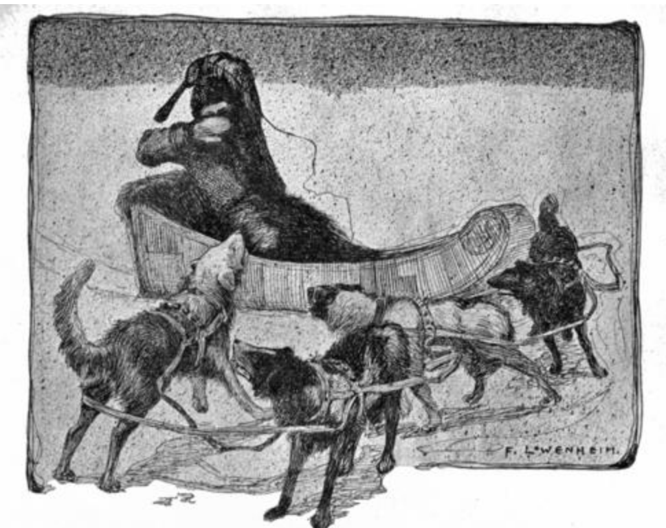
I BELABOURED HIM WITH THE OAK WHIP-HANDLE.

He proved the ugliest customer of all, and I never before imagined a dog's head could take such a pommeling ere he would give in. Failing to get hold of me, he tore the robes and parchment side of the cariole. It was well for me that the traces of the fourth dog, fastened to the front of the cariole, so held him back, that he was unable to do more than savagely growl at me, while he at times fastened his teeth into everything within reach. His efforts however kept the cariole twisting in a most erratic fashion, and so I had to keep up the fight and at the same time look well to my balance so as not to be upset.